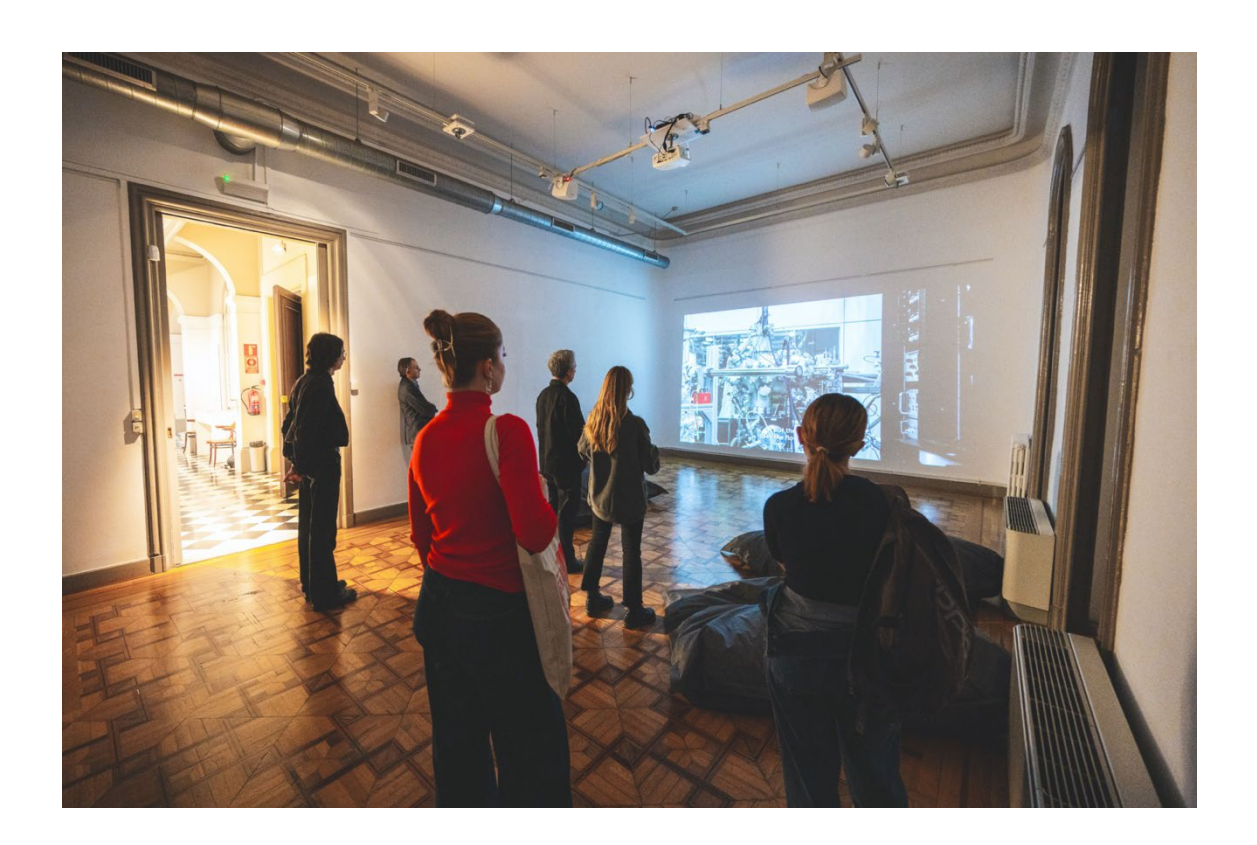
Figure 1. "The machine and the flower" by Pau Faus. View of the exhibition at Casa Elizalde Barcelona.

The video was <u>exhibited</u> at Casa Elizalde from November 16 to December 23 (Figure 1). On November 27, there will be a <u>dialogue</u> of Pau Faus with Victoria Sacco, curator, and project coordinator at LOOP Barcelona, and Pau Subirós, screenwriter, director, and producer, on the theme "Science, technology and documentary perspective".