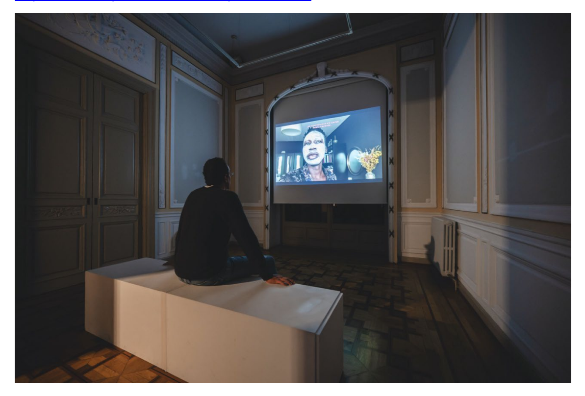
Figure 6. "We are here" by Camila Flores-Fernández. View of the exhibition at Casa Elizalde Barcelona.

https://www.a-place.eu/en/media-production/54