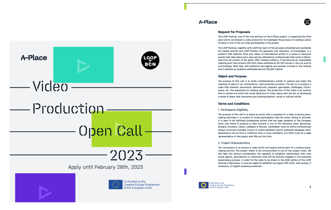
Figure 4. Documentation of the open call