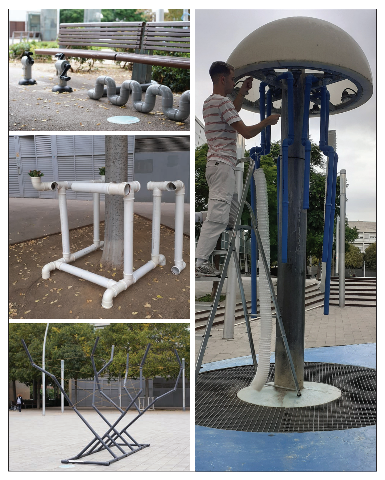
Figure 3: A collective artistic installation in the city of L'Hospitalet (Barcelona, Spain) made by students from the School of Architecture La Salle and high school pupils from secondary schools of the Bellvitge neighbourhood, to create a new sense of place in public spaces.