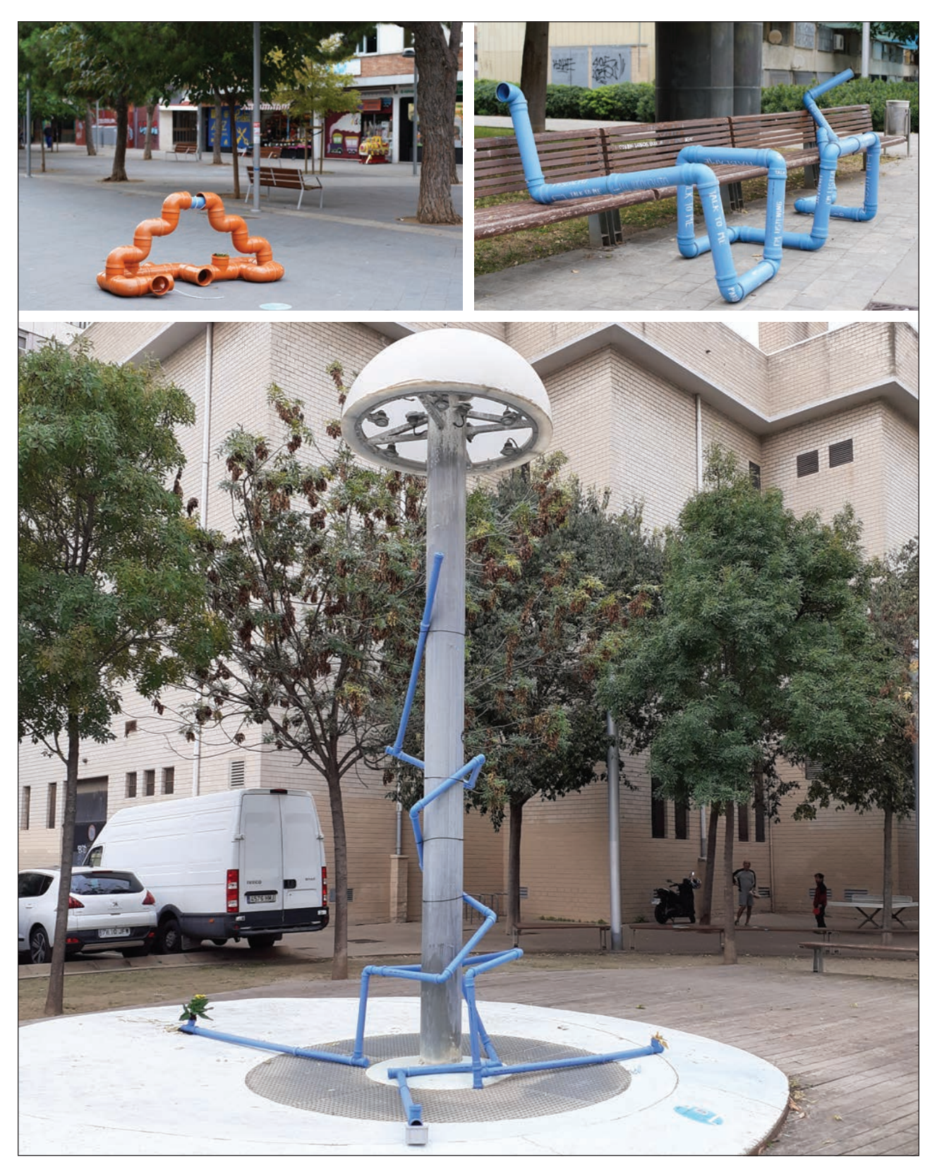
Figure 2: A collective artistic installation in the city of L'Hospitalet (Barcelona, Spain) made by students from the School of Architecture La Salle and high school pupils from secondary schools of the Bellvitge neighbourhood, to create a new sense of place in public spaces.