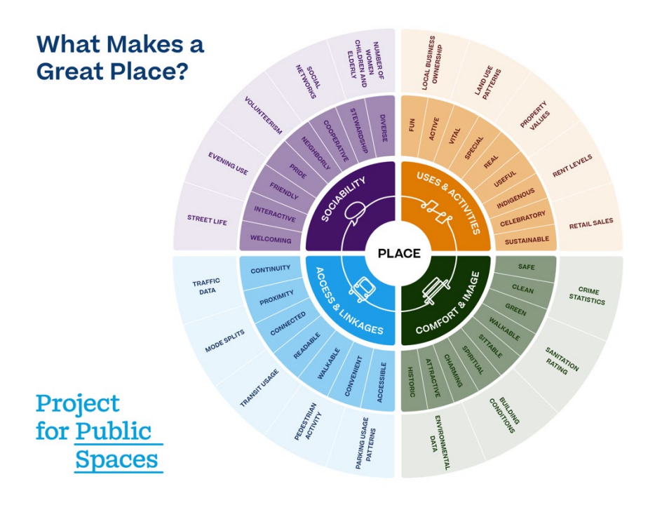
Figure 1. Place diagram by Project for Public Spaces (2017). More info: https://www.pps.org/article/grplacefeat

According to Project for Public Spaces (2018), "placemaking" is "an overarching idea and hands-on approach for improving a neighbourhood, city or region", which "inspires people to collectively reimagine and reinvent public spaces as the heart of every community", "strengthening the connection between people and the places they share" (Figure 1).